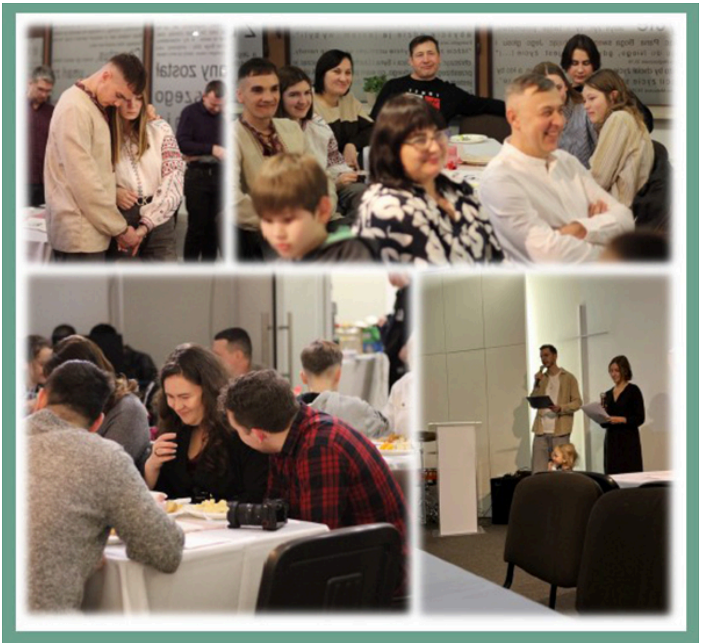
Family evening at the church