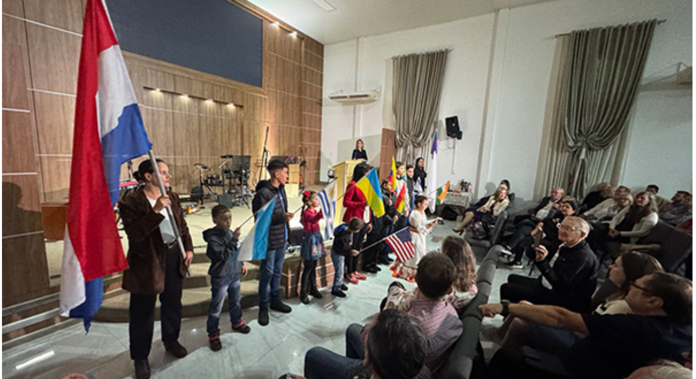
Flag presentation of countries represented at the convention