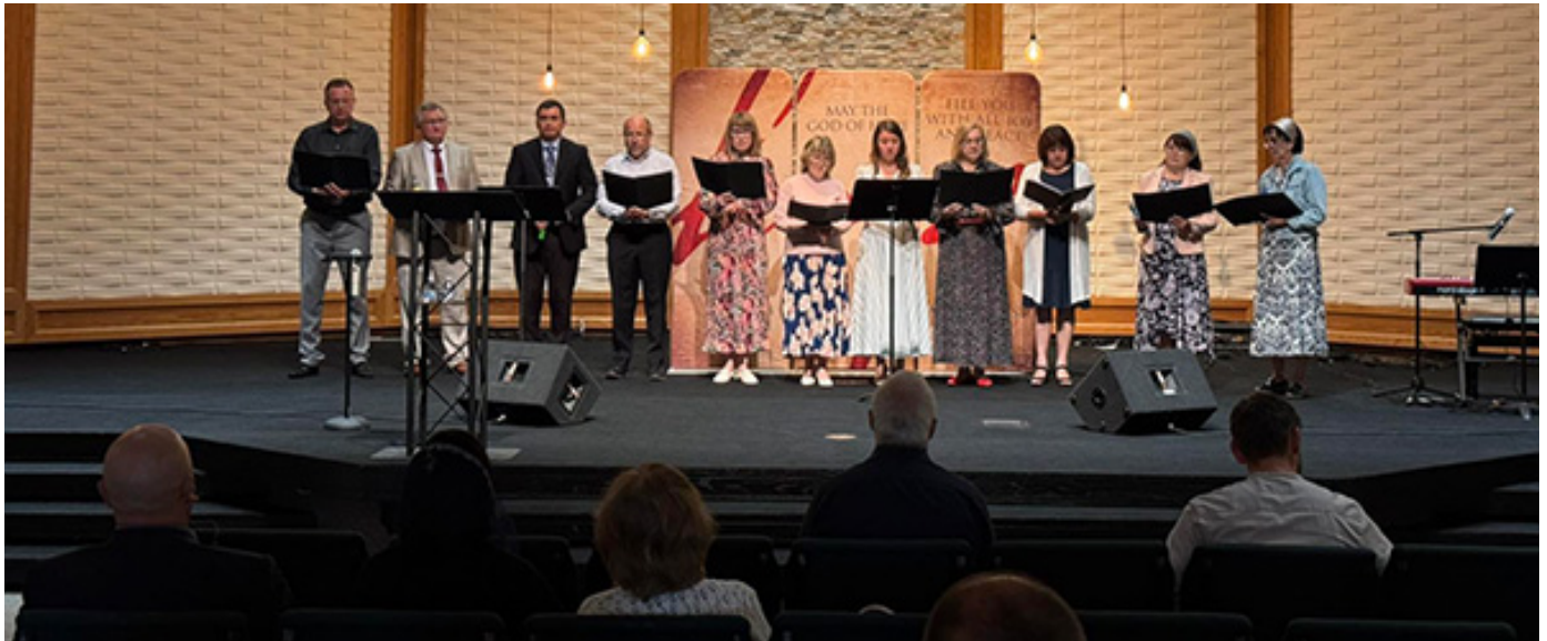
Guests from the church in Montebello

This is a wonderful example of mutual church friendship! How wonderful would it be if more churches, especially the youth, were able to visit other local churches in an effort to encourage and attract more people and youth to these churches.