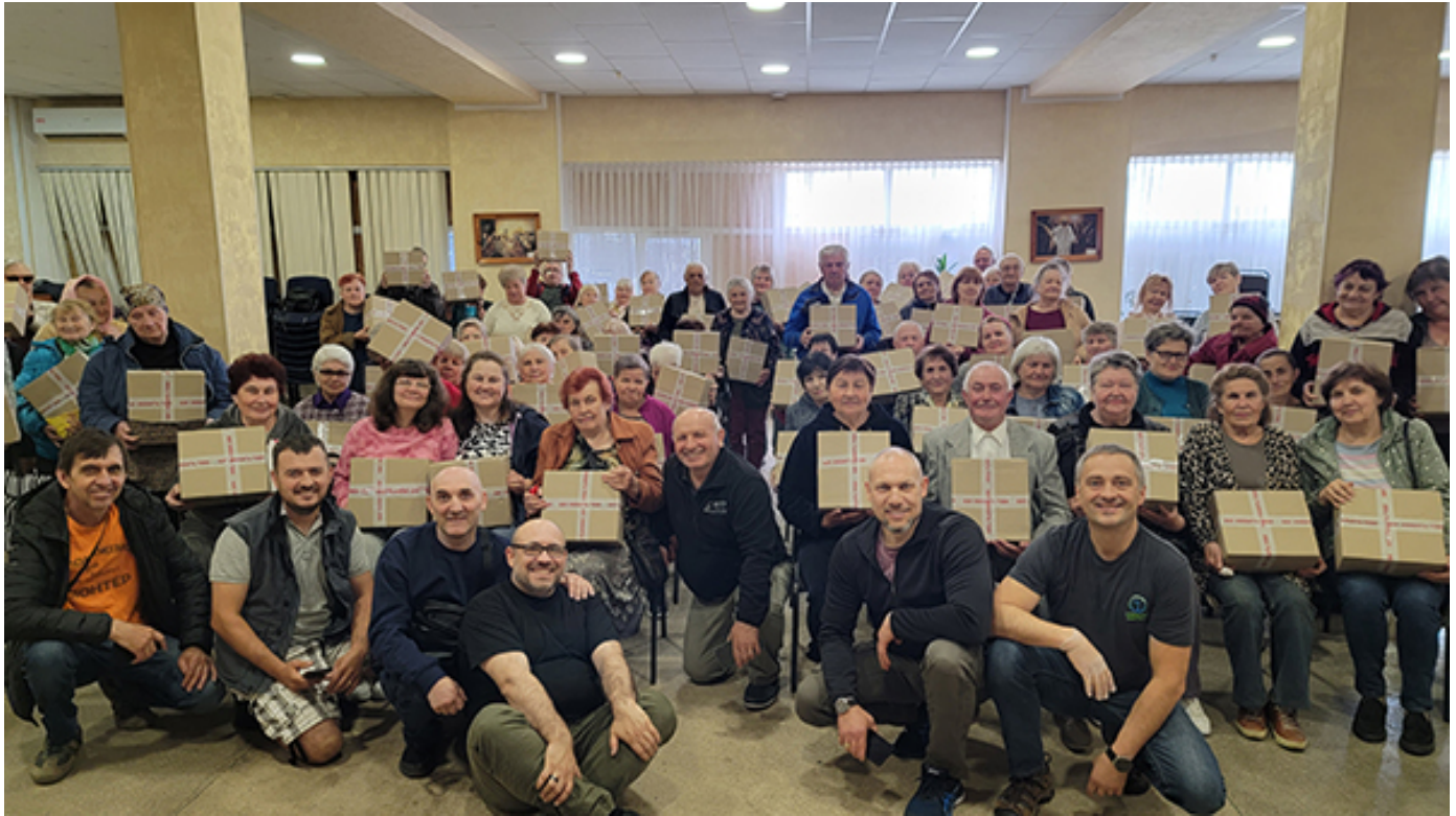
After giving out presents at the local church