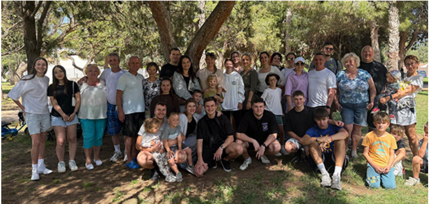
During the church picnic