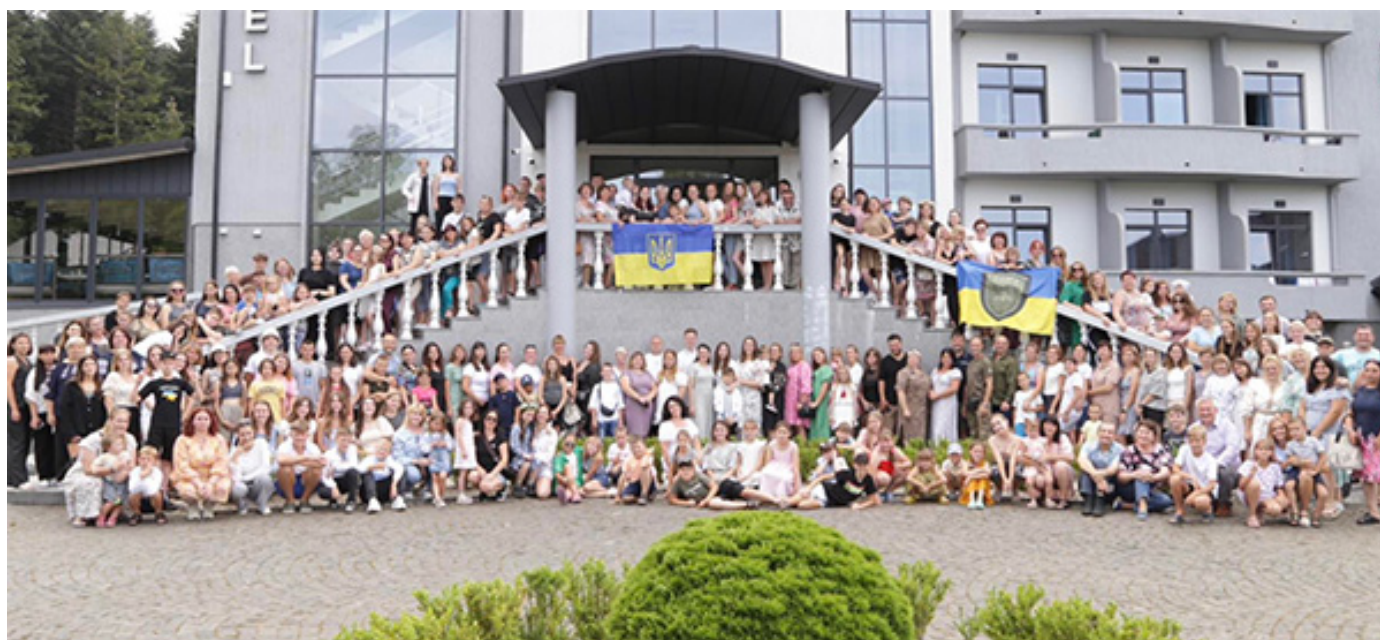
One of the camps for widows and orphans

Beginning in 2016, there has been an ongoing ministry for those who have suffered as a result of the war in Ukraine – ministry to the widows and orphans. The ministry is called “Heart to Heart,” because healing happens when one heart responds to the pain of another. Many of those who benefit from this ministry have never been to church, and do not know God, but they have deep pain and scars of war. These meetings provide a time when they can get some support, mental and spiritual healing, hear the message of Christ, and experience the love that they are longing for. More details... (in Russian only).