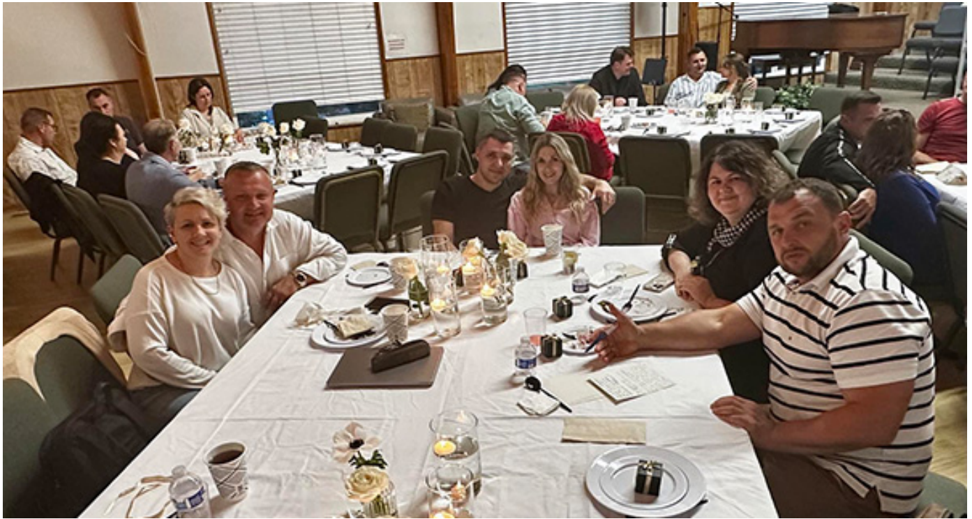
During the “Romantic Evening”