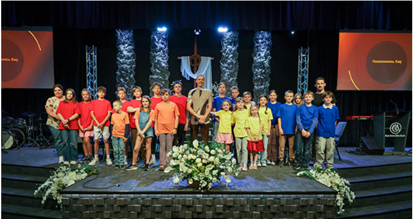
Brain-Ring team participants