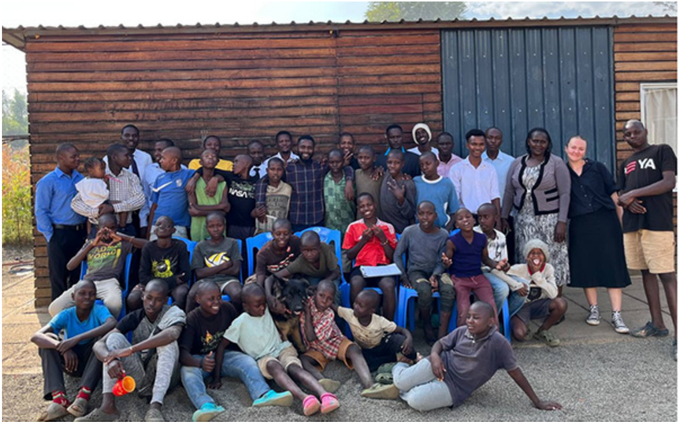
Reconnect Camp – a camp for children, and their parents and guardians