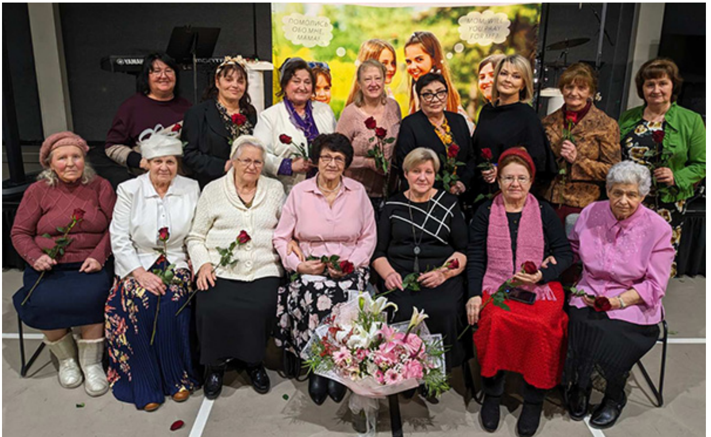
Part of the widows, orphans, and desolate group who were gathered at the Bryte Church