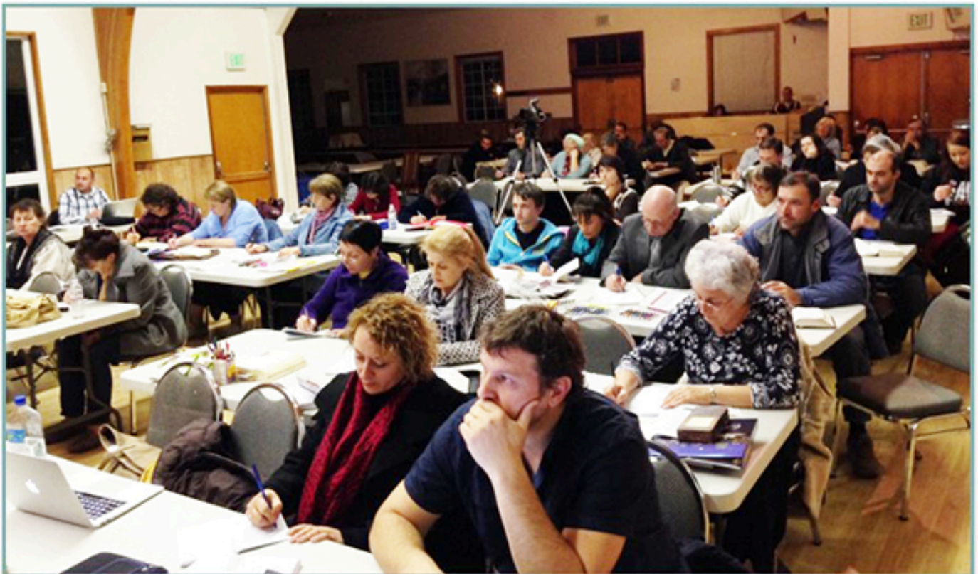
During one of the teaching sessions

Getting an education in American seminaries is not always possible for everyone due to the language barrier, time restraints, and financial burdens. However, for those who wish to study the Word of God, there are a lot of other opportunities. One of those opportunities is studying within the ministry of the PCSBA’s ministry partner – Eurasian Bible Institute, “Ministry of Instruction.” Registration is now open for enrollment. More details... (in Russian only).