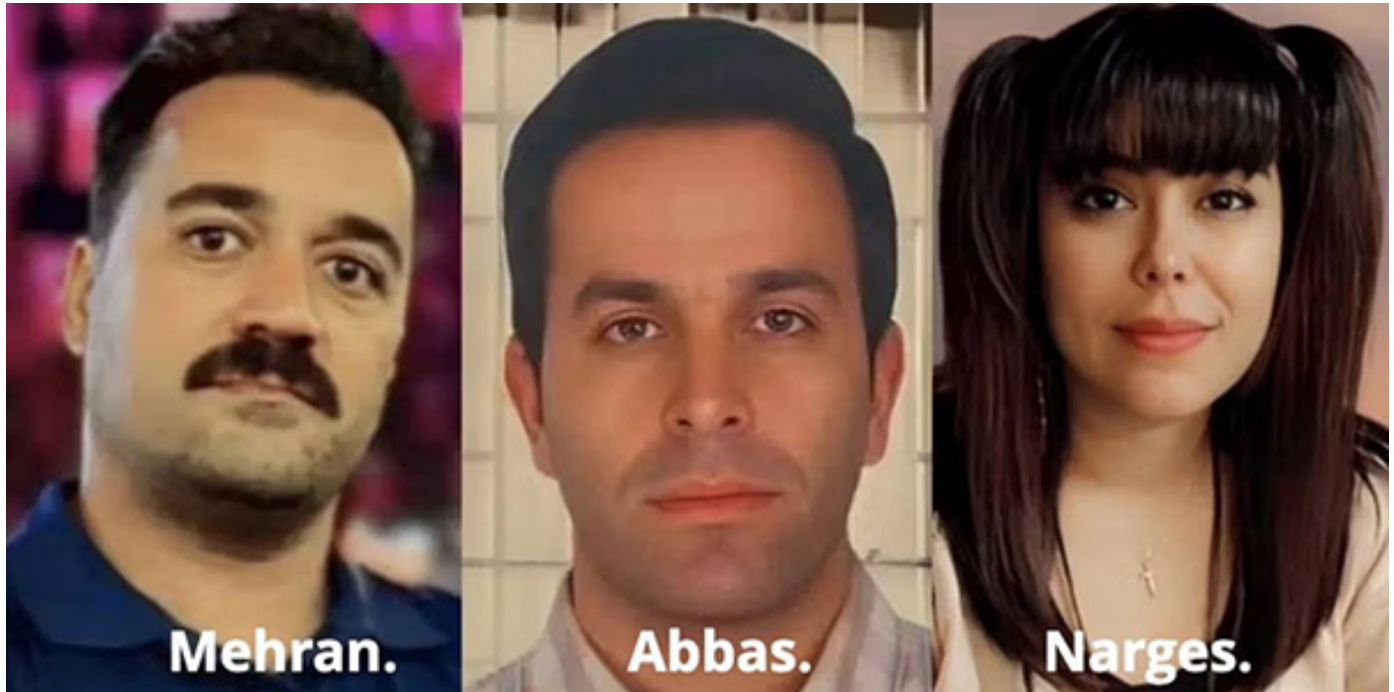
Convicted brothers and sister with a long prison sentence in Iran