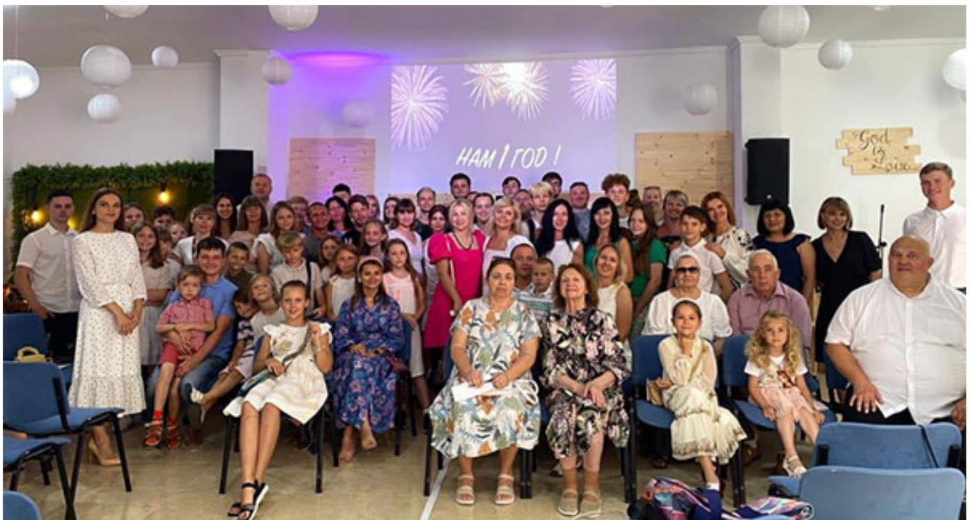
The church at Torrevieja, Spain

It is not easy to be a pastor in a church of Ukrainian refugees. Many of them are struggling for survival in a city where no one cares about them, where it is hard to find a job to provide for their families and have enough to feed and take care of their families. It is especially difficult when the pastor unexpectedly loses his job. What are they to do? Where do they get the strength not to get discouraged themselves, while being an encouragement and help to others? Read more... (in Russian only).