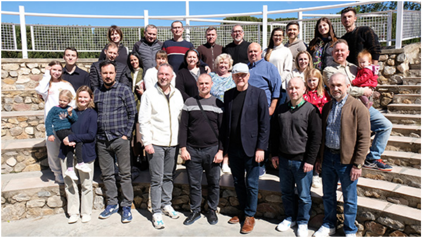
Participants of the founding meeting of the Association of ECB in Spain