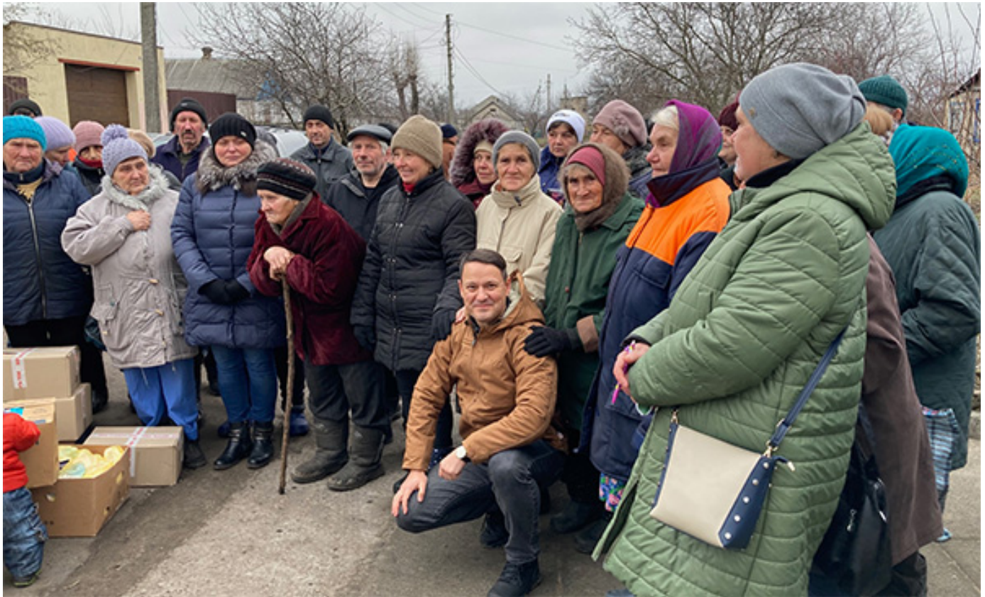
Distribution of humanitarian aid to local residents