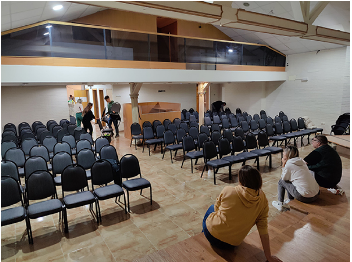
New church meeting room