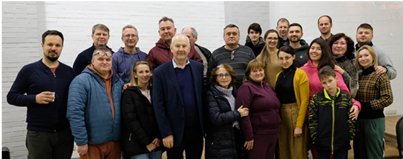
During one of the meetings in Valencia

The head of the PCSBA planned a trip to Spain as far back as 2020, but due to the pandemic, it had to be postponed until January 2023. The purpose of the trip was to teach about the building up of the church, to visit the church services in Valencia, and to meet with the local church leaders. Read the details in the article by I. Mileyev - click this link.