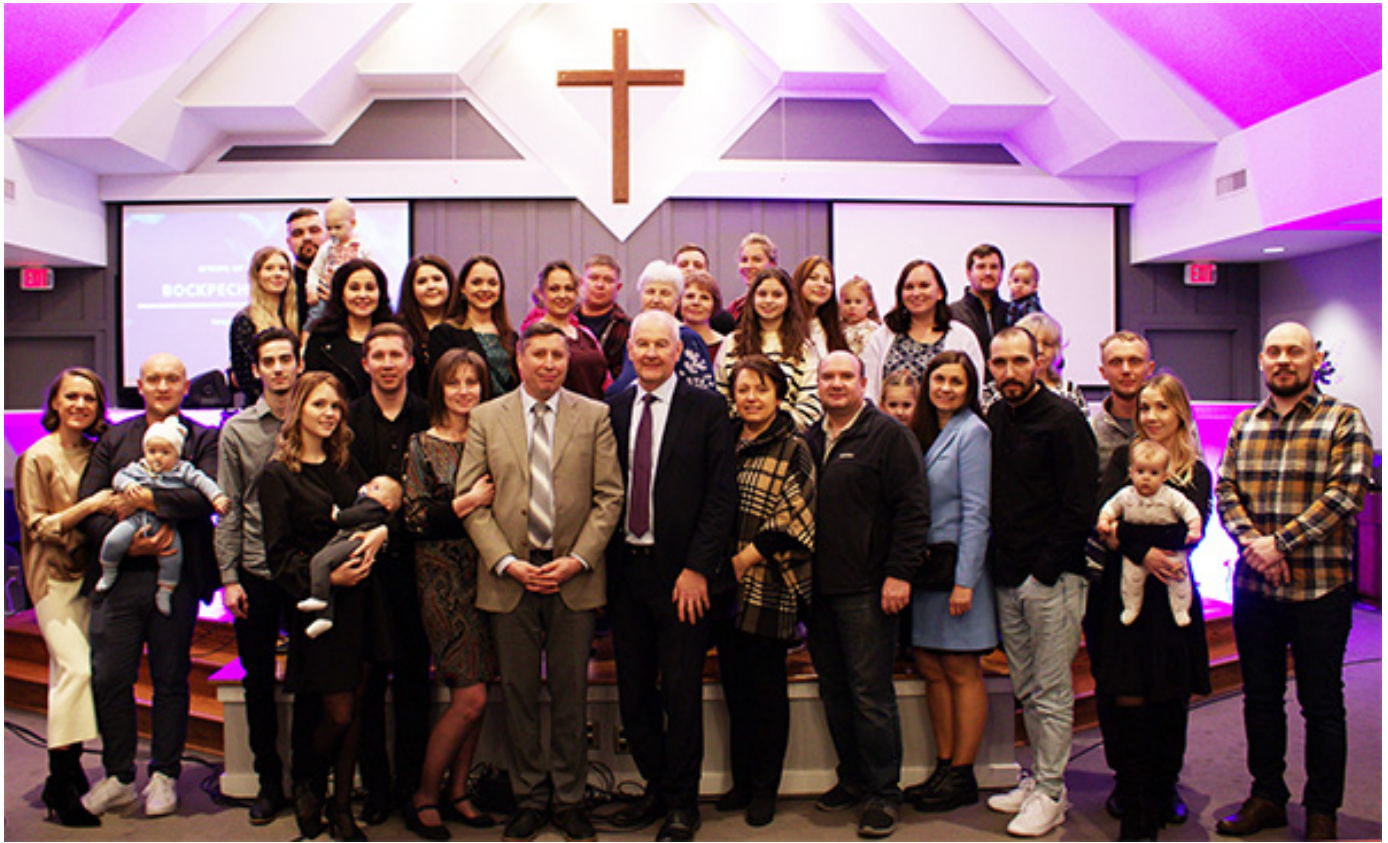
Happy birthday, Spring of Life Church!