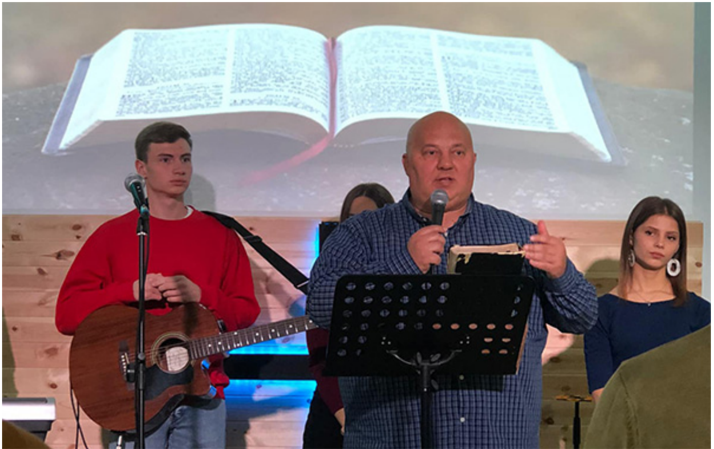
While serving in the church of Tarrivieja, Spain