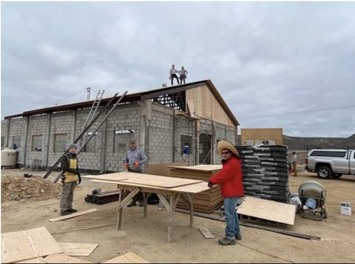
Building a Church in Mexico