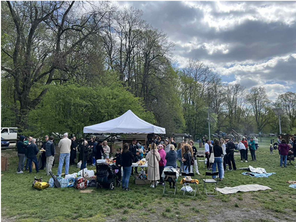
Picnic for Refugees