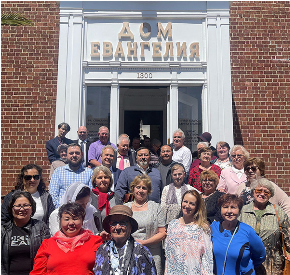
After Fellowship at the House of the Gospel Church