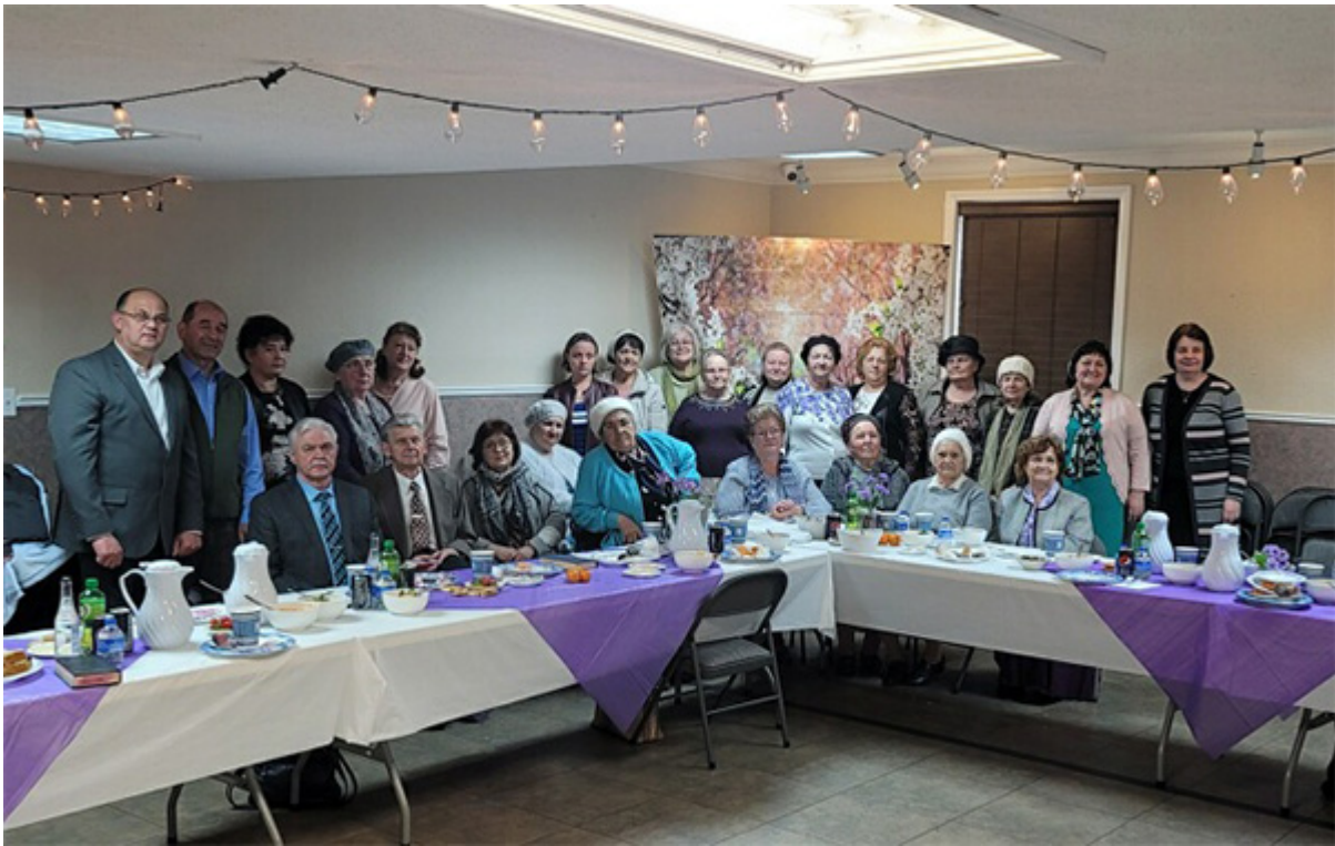
During One of the Meetings at the Slavic Baptist Church of West Sacramento