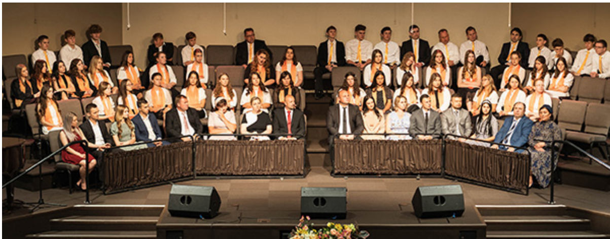
The new ministers with their spouses sit in the front row

Read here about the ordination (in Russian only) which took place on May 22, and watch the recording of the church service on the church’ YouTube channel .