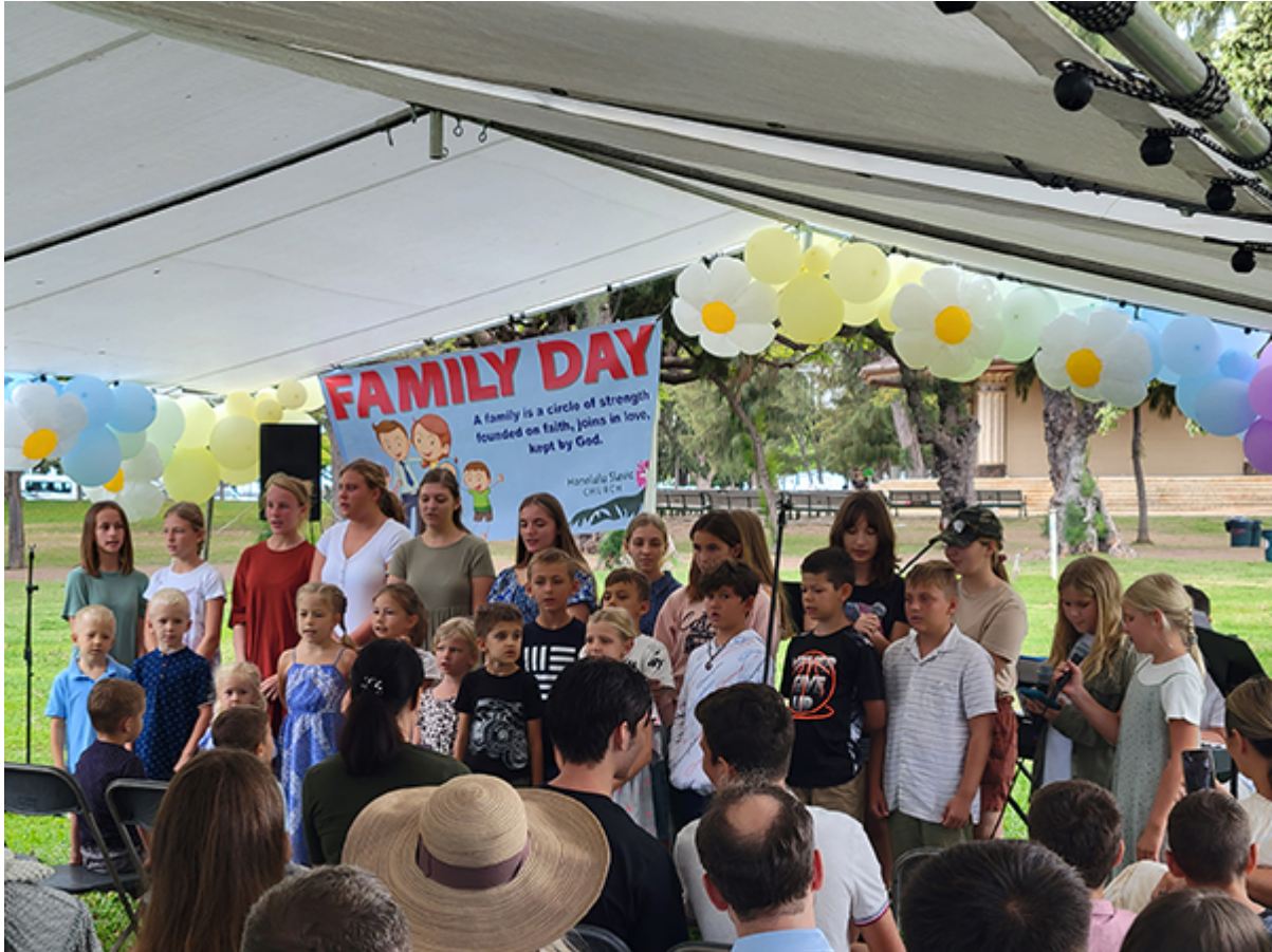
Children also Participated in the Church Service

event which emphasized the importance of the family as the union of one man and one woman created by God in His likeness and image and for His purpose. About 140 people joined this joyful celebration including families of guests from Ukraine, Belarus, as well as attendees from Washington, California, and New Jersey. For more information, read on the Association's website.