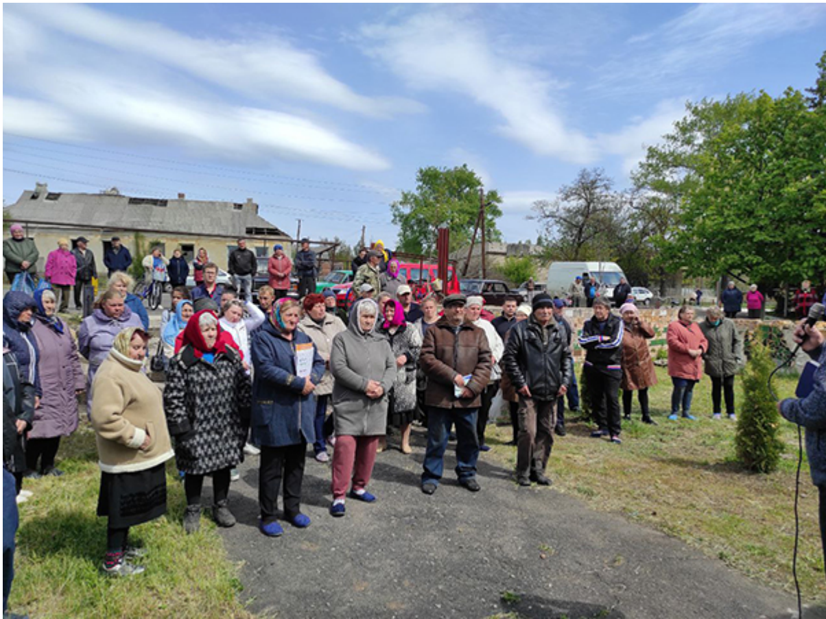
Church Service in a Village