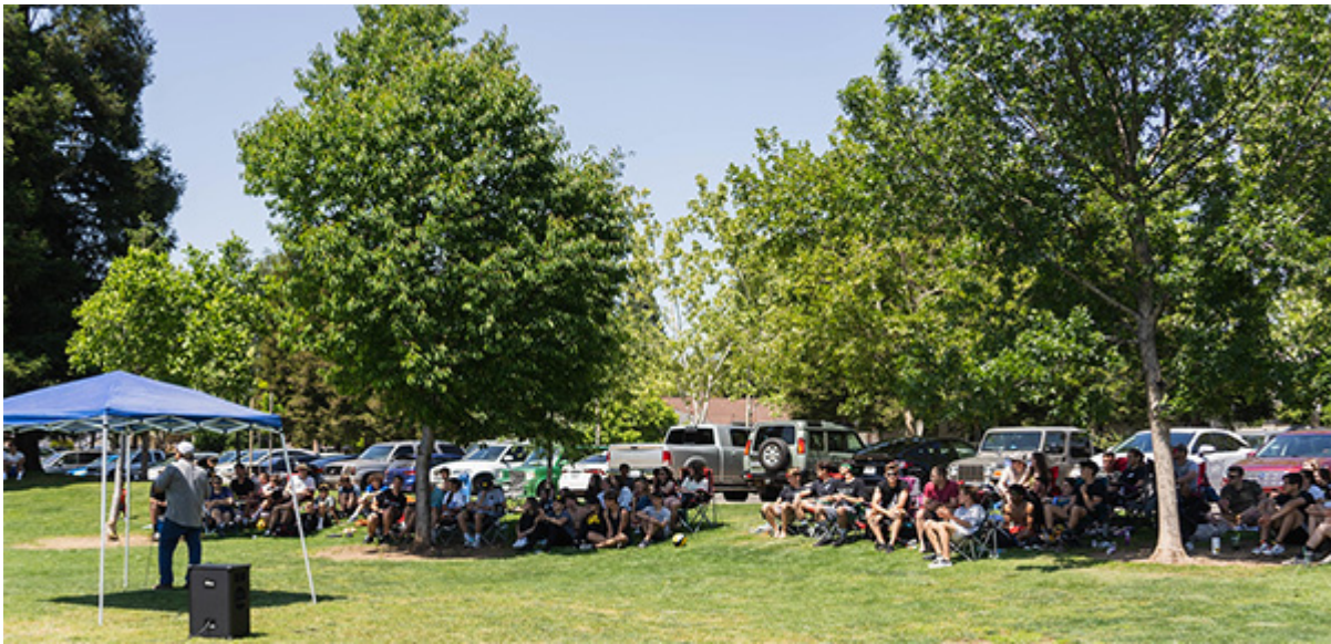
Bad England witnessing to youth about him becoming Christian