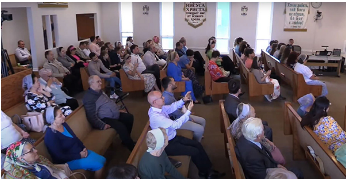
House of Prayer Church