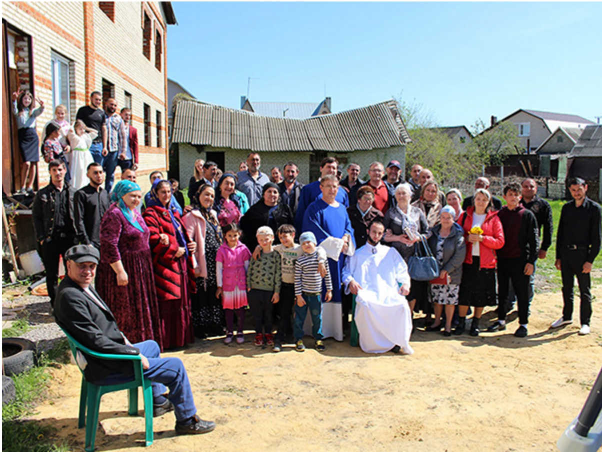
A Group of Gypsy Believers after The Baptism Service for One More Young Member