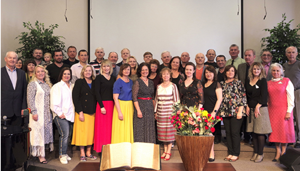
Participants of the Pastors' and Women's Meetings in the southern California