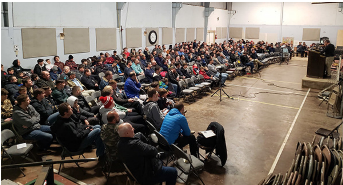
Men's Retreat is Becoming More Popular Every Year!

On February 18-20, Russian Baptist Church of Bryte organized a retreat for the fathers and sons at the place not too far from Sacramento. The retreat took place in an informal setting, with unified prayer, beautiful nature, campfire food, extreme sports and off-roading which helped to offer some quality time and strengthen the relationship of at least three generations. The youngest camp participant was 5 years old, while the oldest was 70 with the total number of people being 320 people. For more information, read on the Association's website – click this link (In Russian only.)