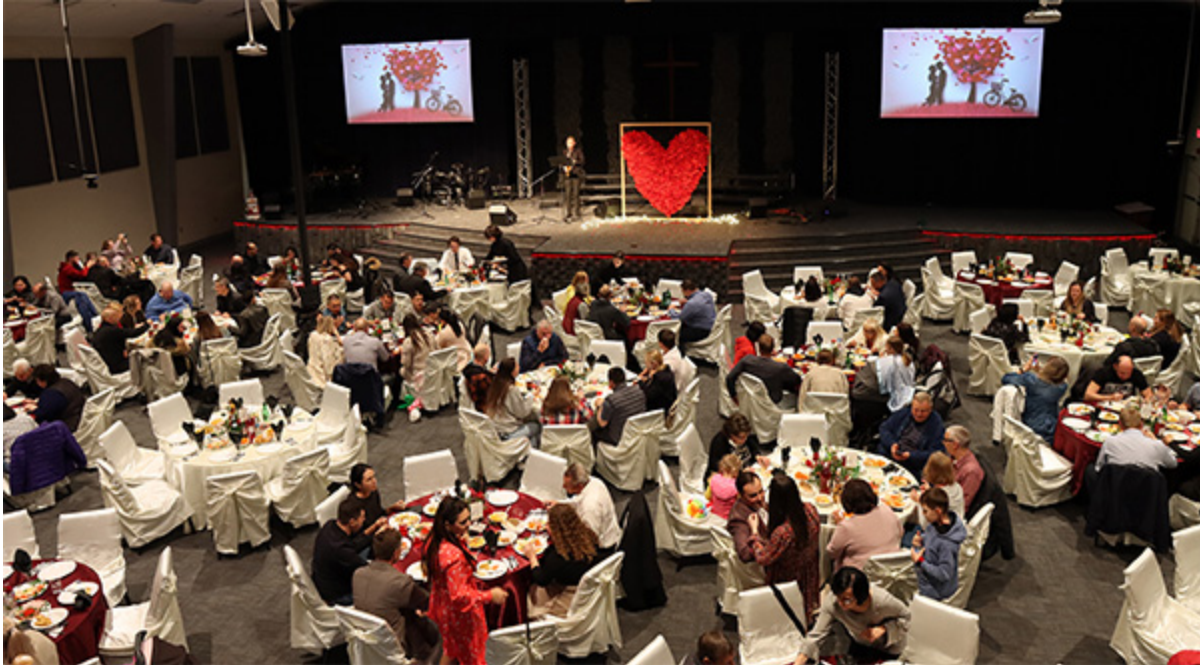
Everything Looked Very Festive!