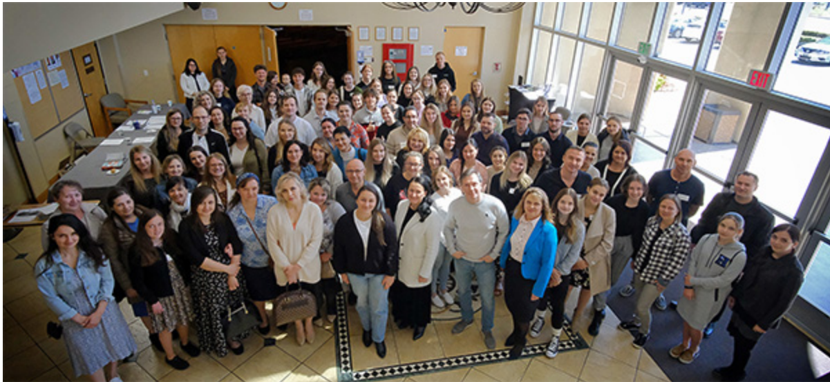
Group Picture of the Conference Participants