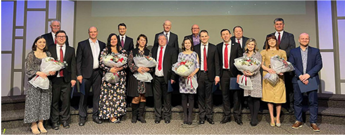
Pastors with New Deacons and Their Wives

(click this link) , to access the full story with more information and pictures, visit the Association's website (in Russian only.)