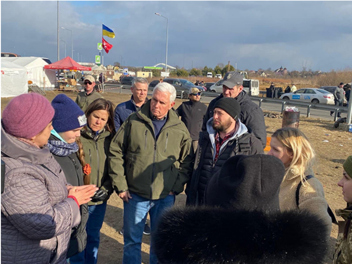
Previous Vice-President of the U.S. Mike Pence speaks with the Ukrainian refugees