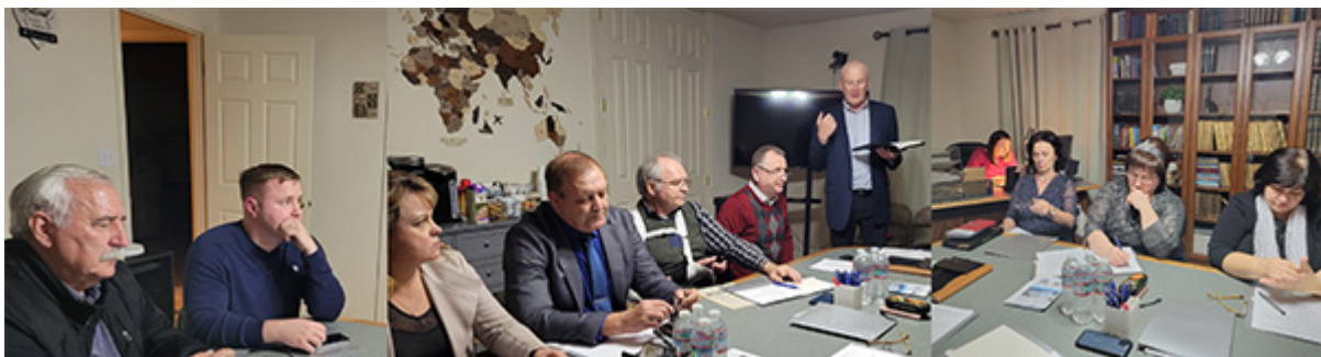
Part of the Attendees of the Department Leaders' Meeting

This year's first meeting of the Association's department's leaders took place on February 18 at the Association's office. The ministry leaders were missing fellowshiping with one another and sharing what they were doing in December, January and February, about the pandemic-related challenges, plans for the future, and shared prayer requests of both their ministries, as well as of their families. In closing of the meeting, these needs were lifted up to the throne of God in prayer.