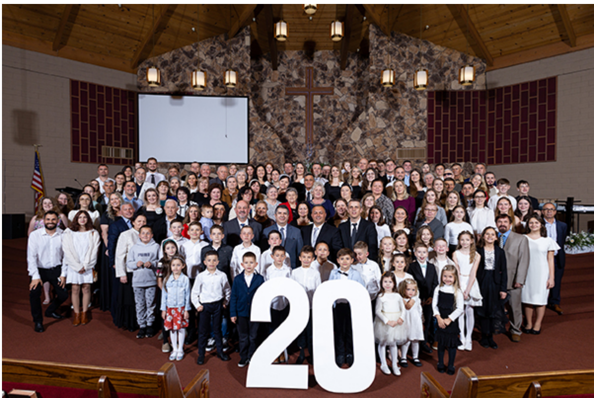
New Hope Church