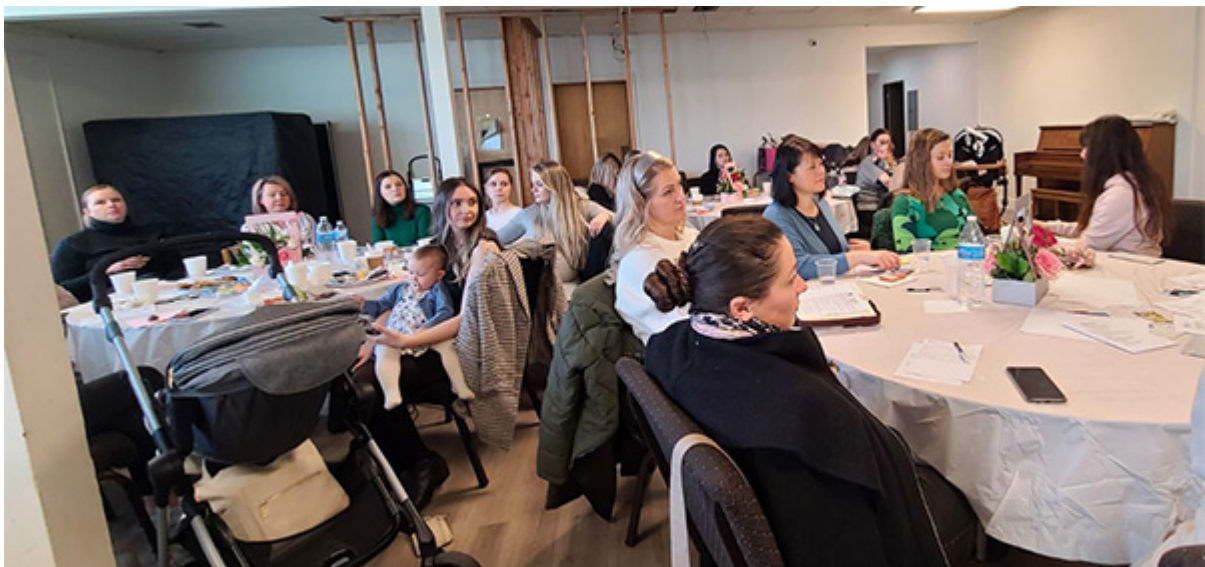
During the Seminar