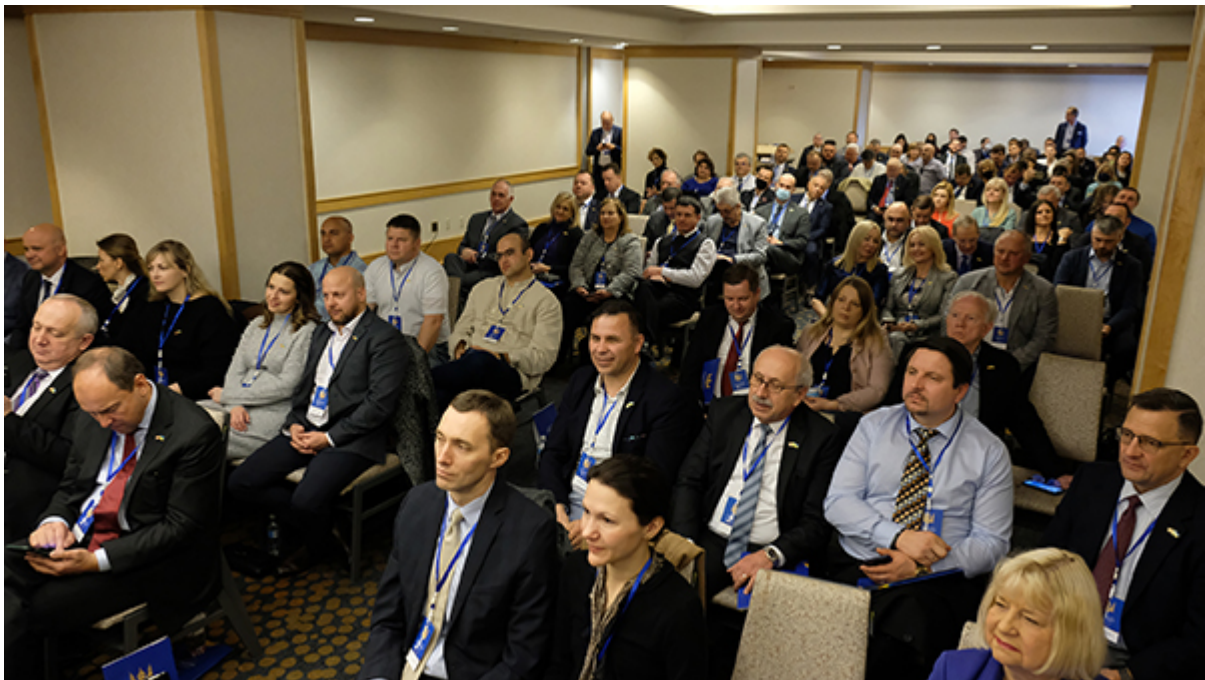
Prayer Meeting Participants