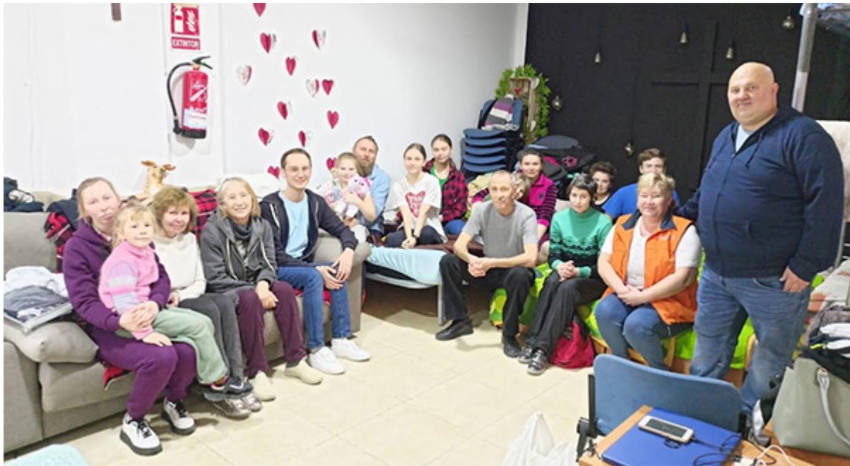
One of the Snapshots of the Life of the Light of Life Church