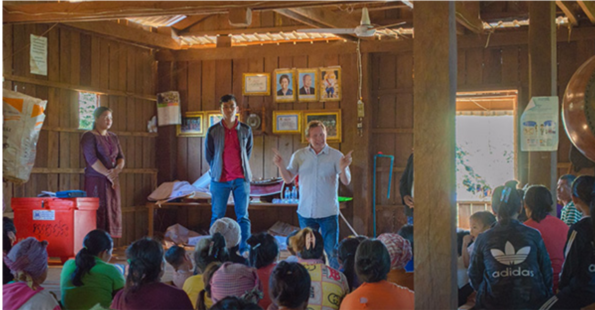
Preaching in One of the Villages