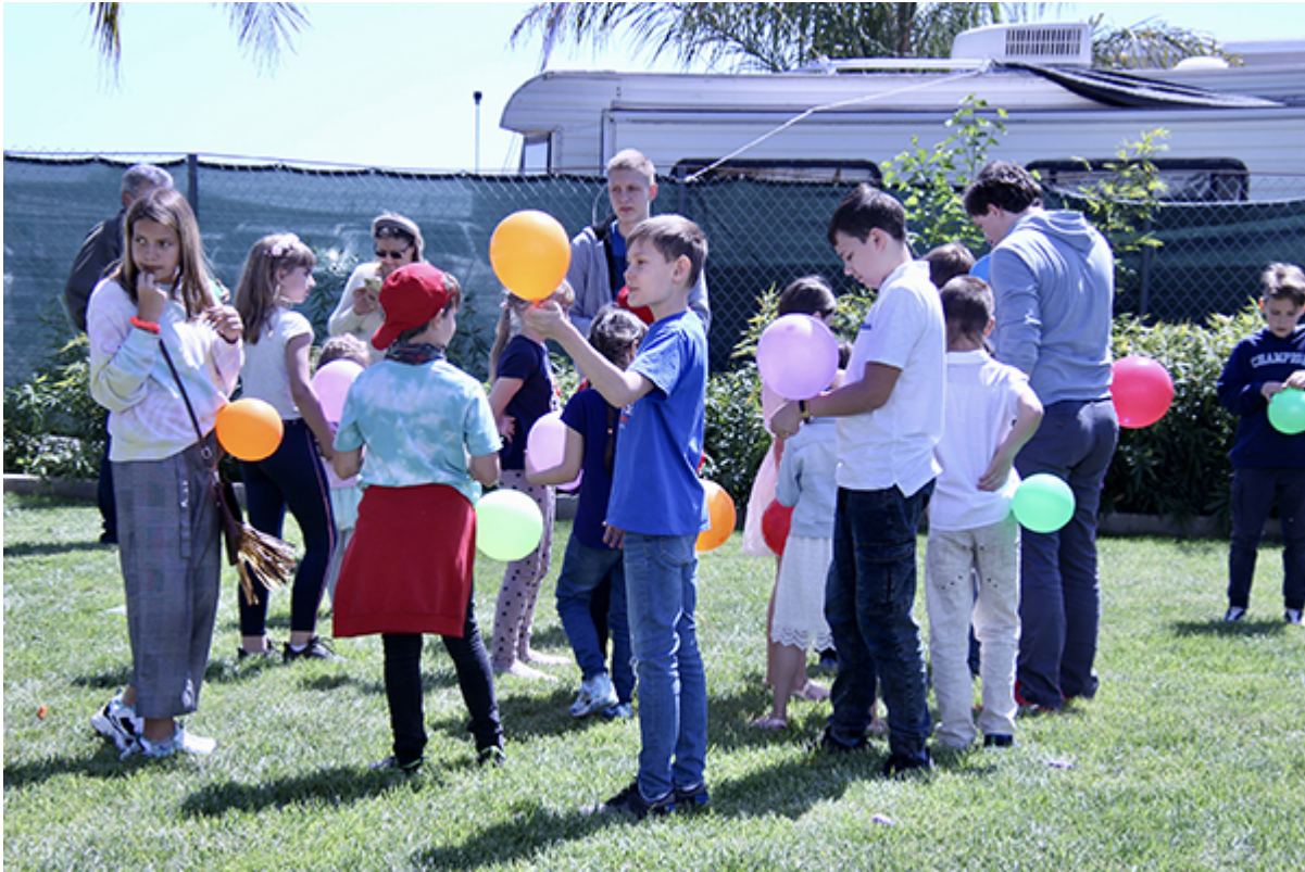
The Children Had Their Own Activities During the Celebration/em>