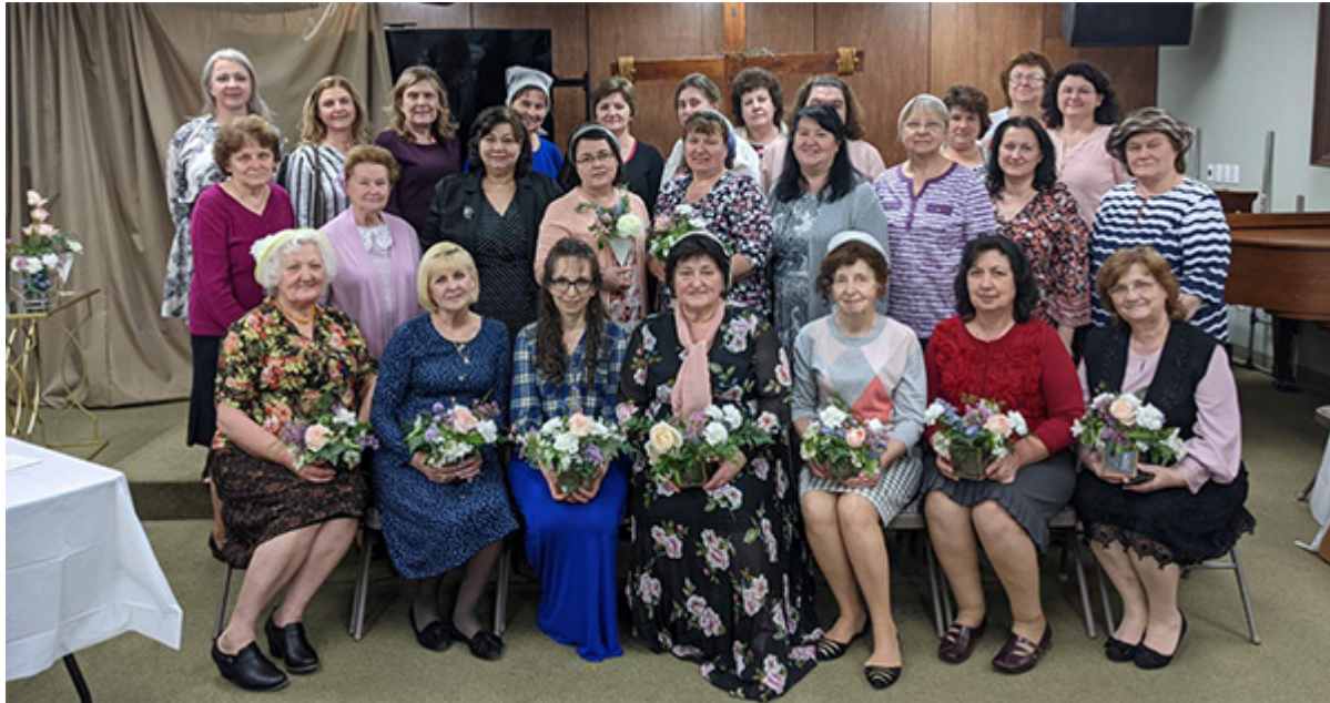
Prayer Breakfast Participants