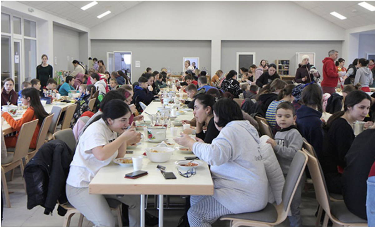
Dining Room of the Relief Center Where Refugees Are Served Hot Food Three Times a Day