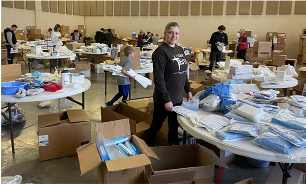
Sorting and Packing of the Medical Supplies for Ukraine