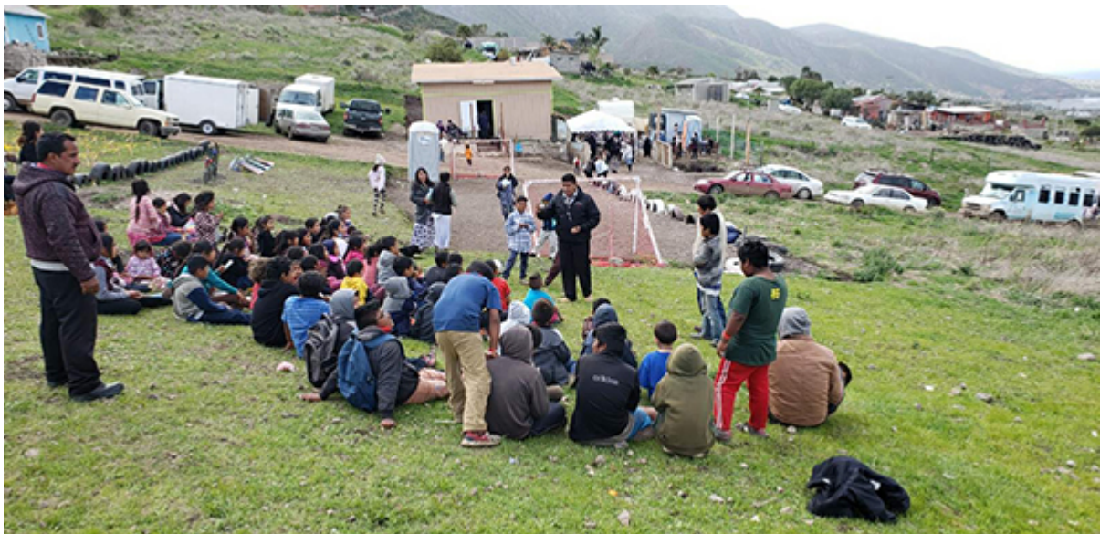
Just like in the days of preaching at the time of Jesus Christ: people sat on the hill and listened