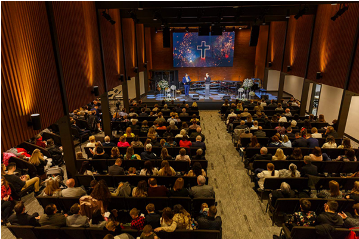
Church Service at the New Church Building