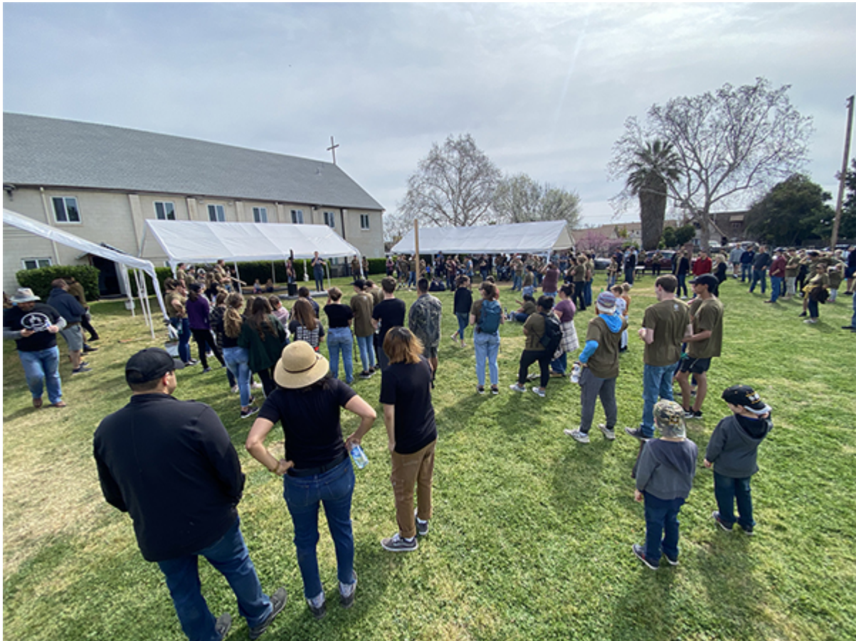
The Service Was Attended by About 300 People