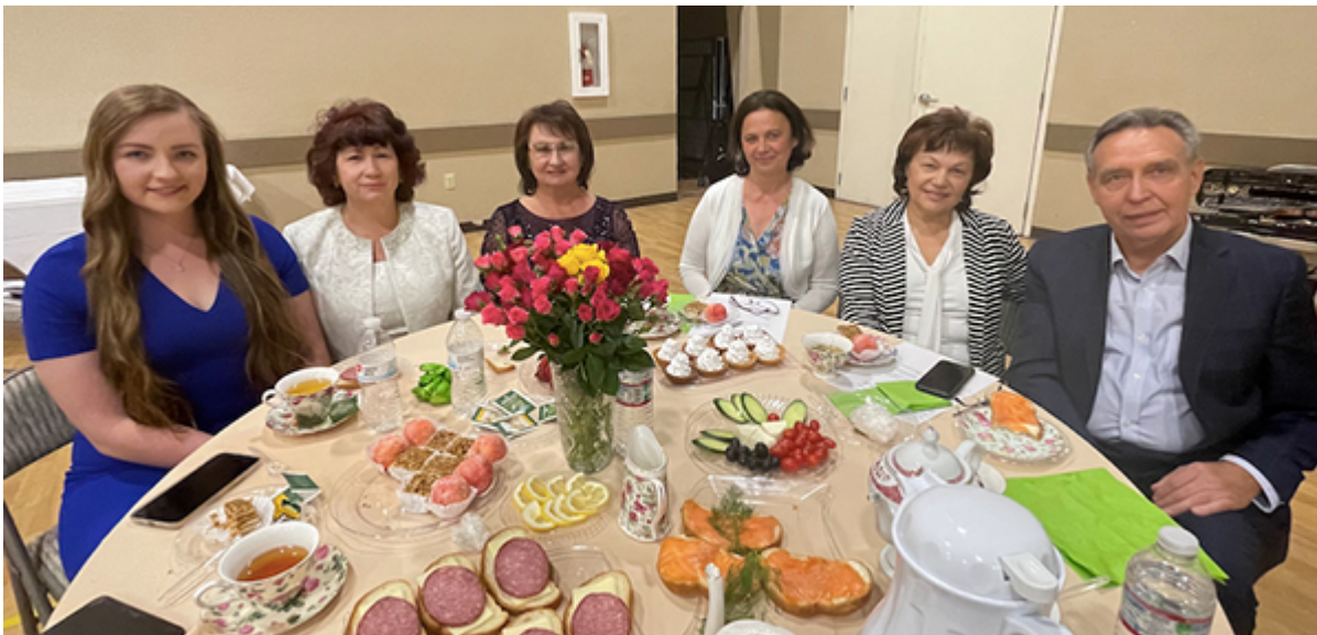
Guests and Organizers of the Event