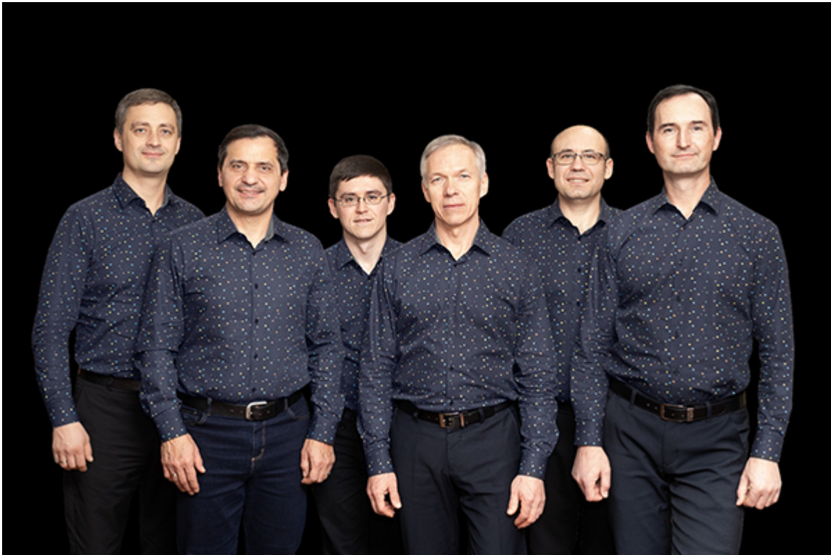
The current members of the «Kovcheg» group