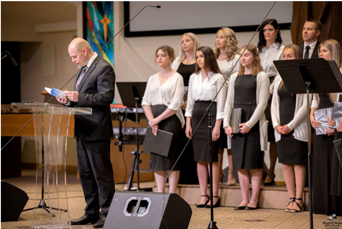
During the Church Anniversary Service