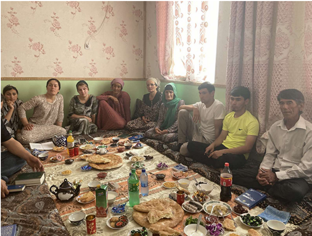
One of the Fellowships with the Believers of Tajikistan