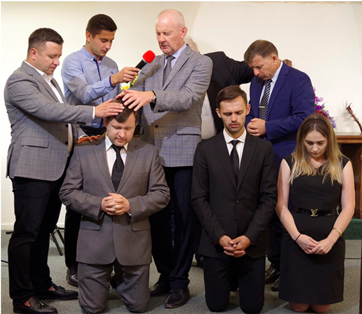
Prayer of Dedication