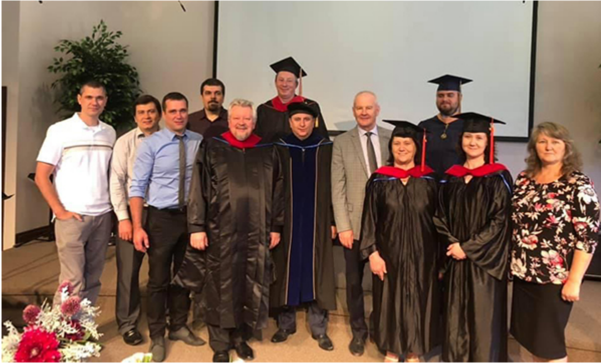
Newly Graduate Masters of Divinity, Instructors, and other students