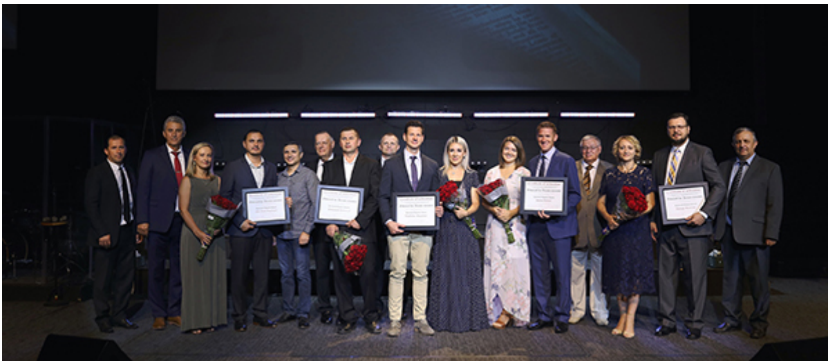
The Team of Ministers Increased by Five New Deacons