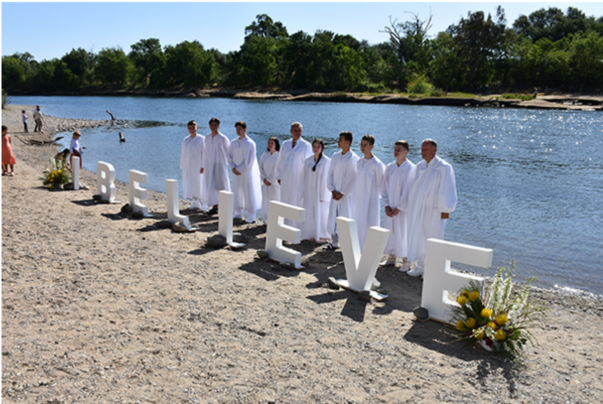
Baptism at the River