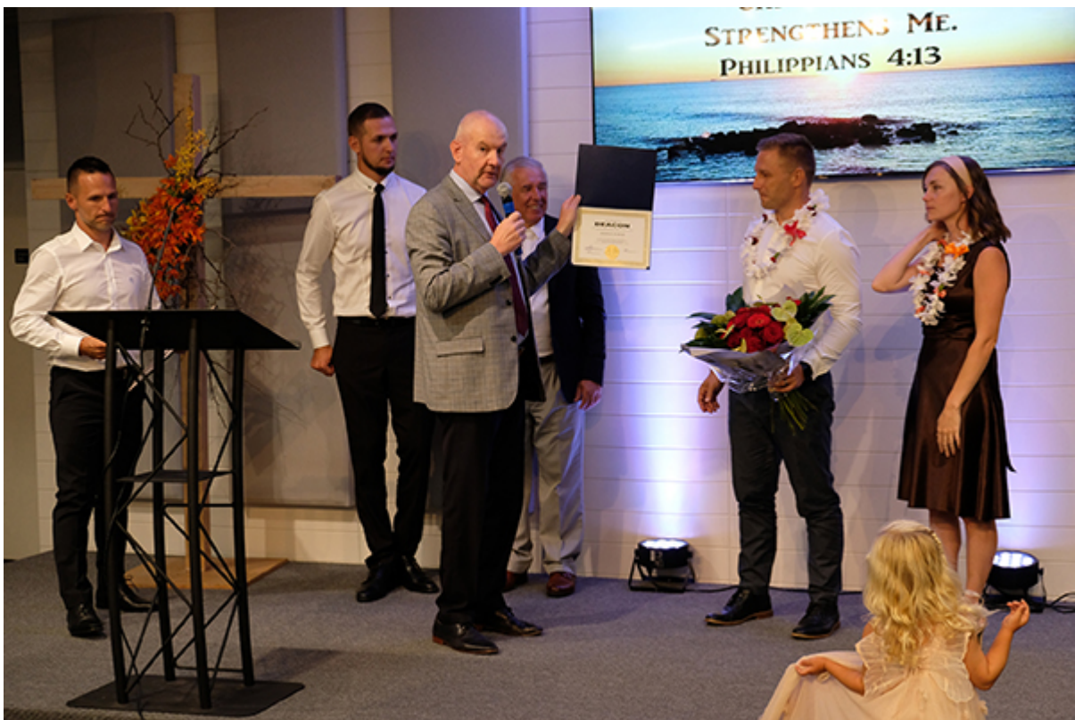
Awarding the Certificate after the Ordination