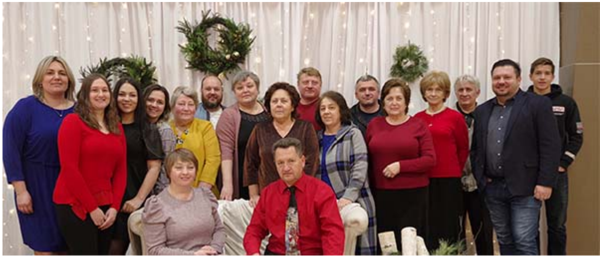
Store Employees and Volunteers