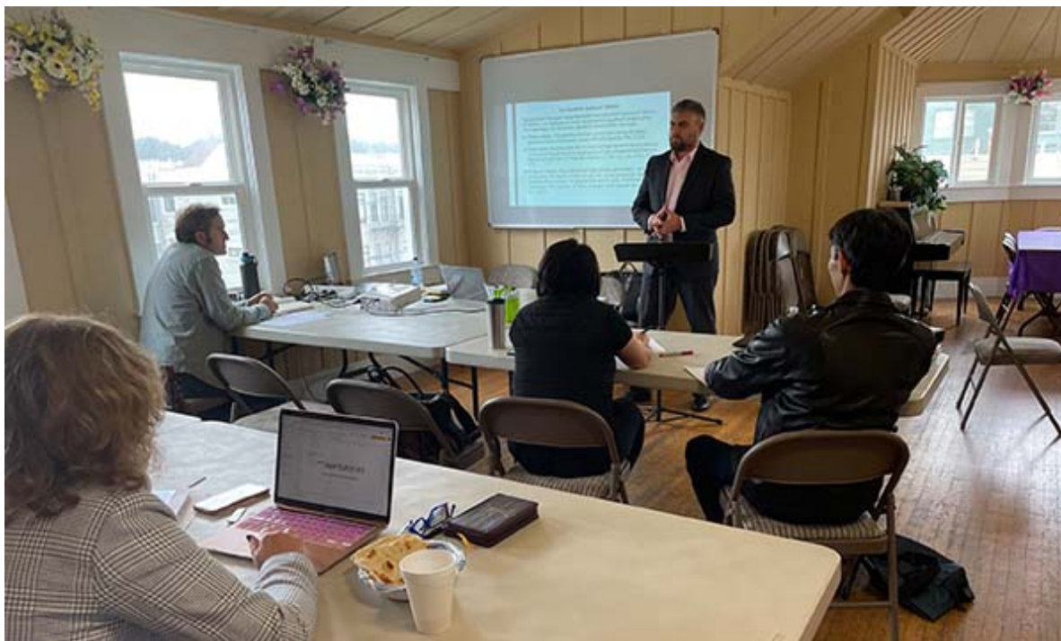
Lesson at a church in San Francisco

leading this department provides more information in his article which can be found on the Association's website – click this link (in Russian only.)