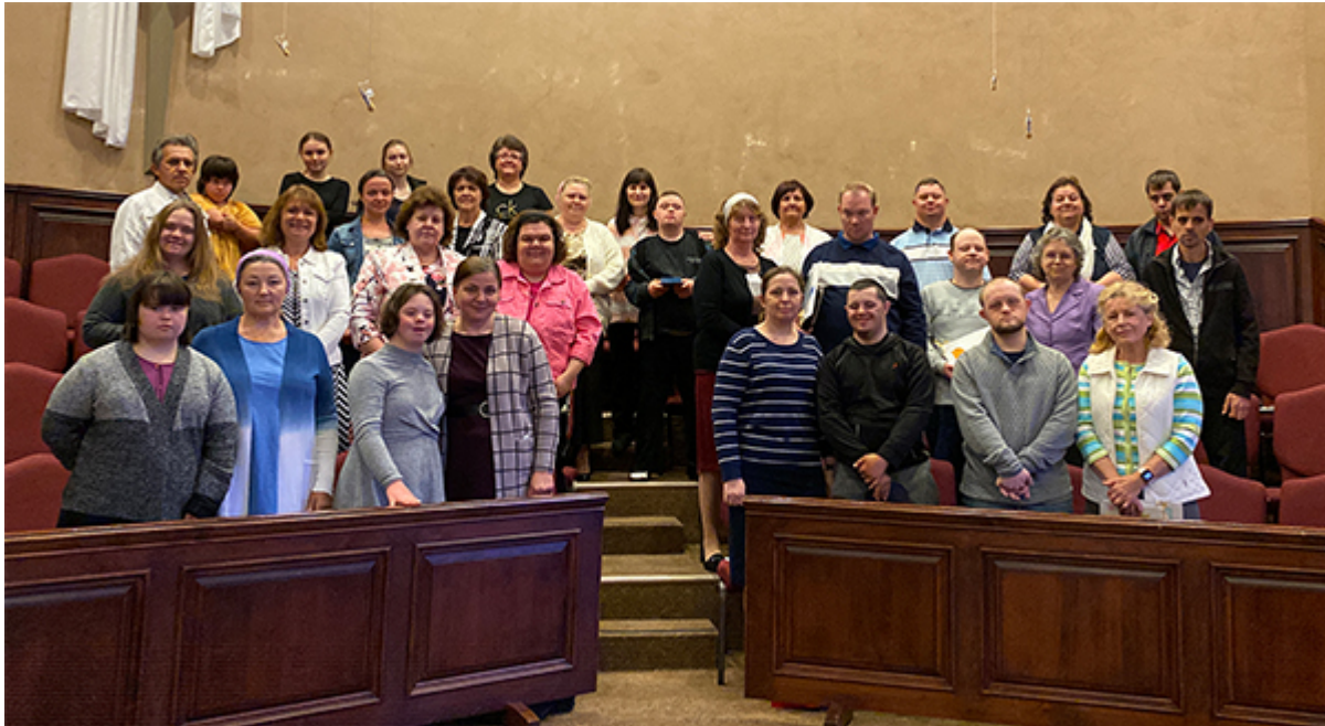
The Joy of Being Together in Fellowship