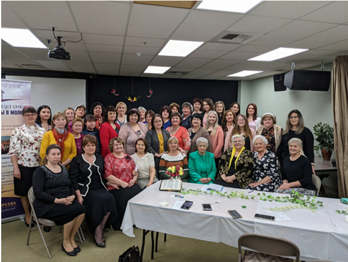
Women Participants of the Prayer Breakfast