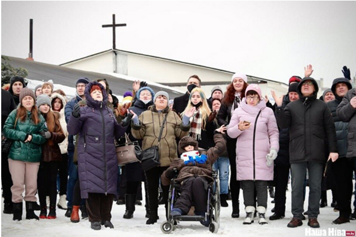
Church Praying Outside