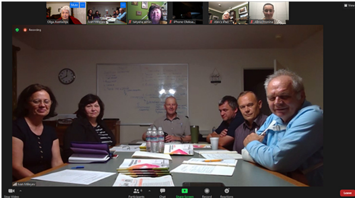
The Meeting Was Mixed of Both the Physical Presence at the Office, as Well as ZOOM Participation