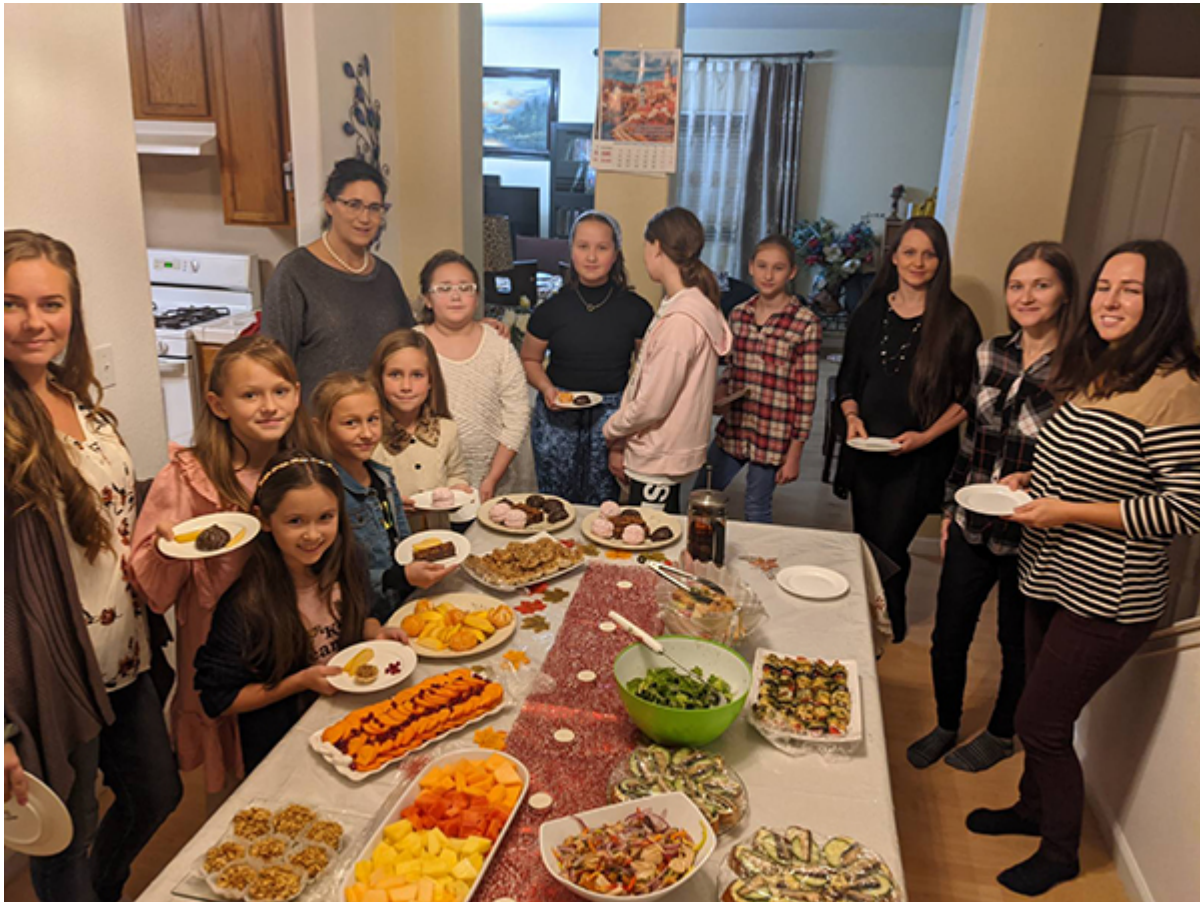
Younger and Older Participants of this Wonderful Ministry