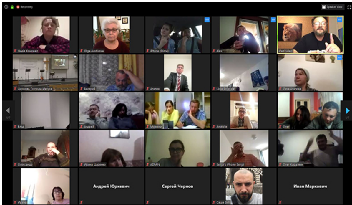
Some of Conference Attendees

The online conference of this movement, which took place on May 24, was attended by about 160 families and individuals from various countries. This was a spiritually edifying conference with the theme of “How not to fall into the trap of illusions and self-deception during the difficult times of God's testing”. For more about this conference, and the movement as a whole, read on the Association's website (in Russian only.)