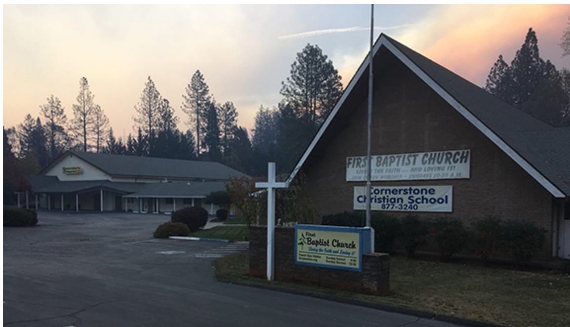
Miraculously Preserved Church Building