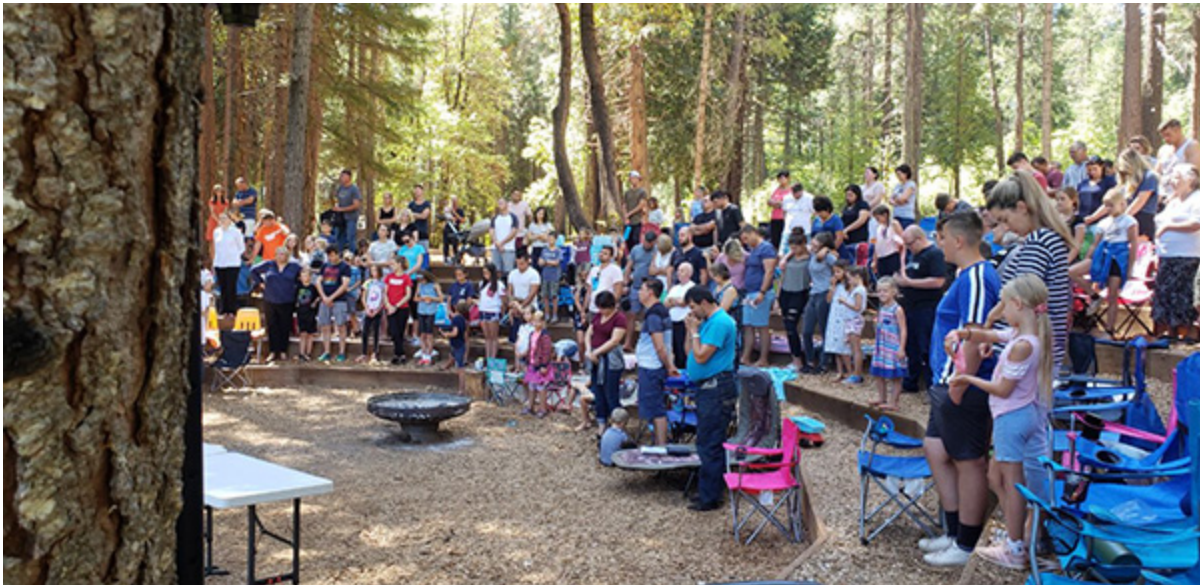
During the service