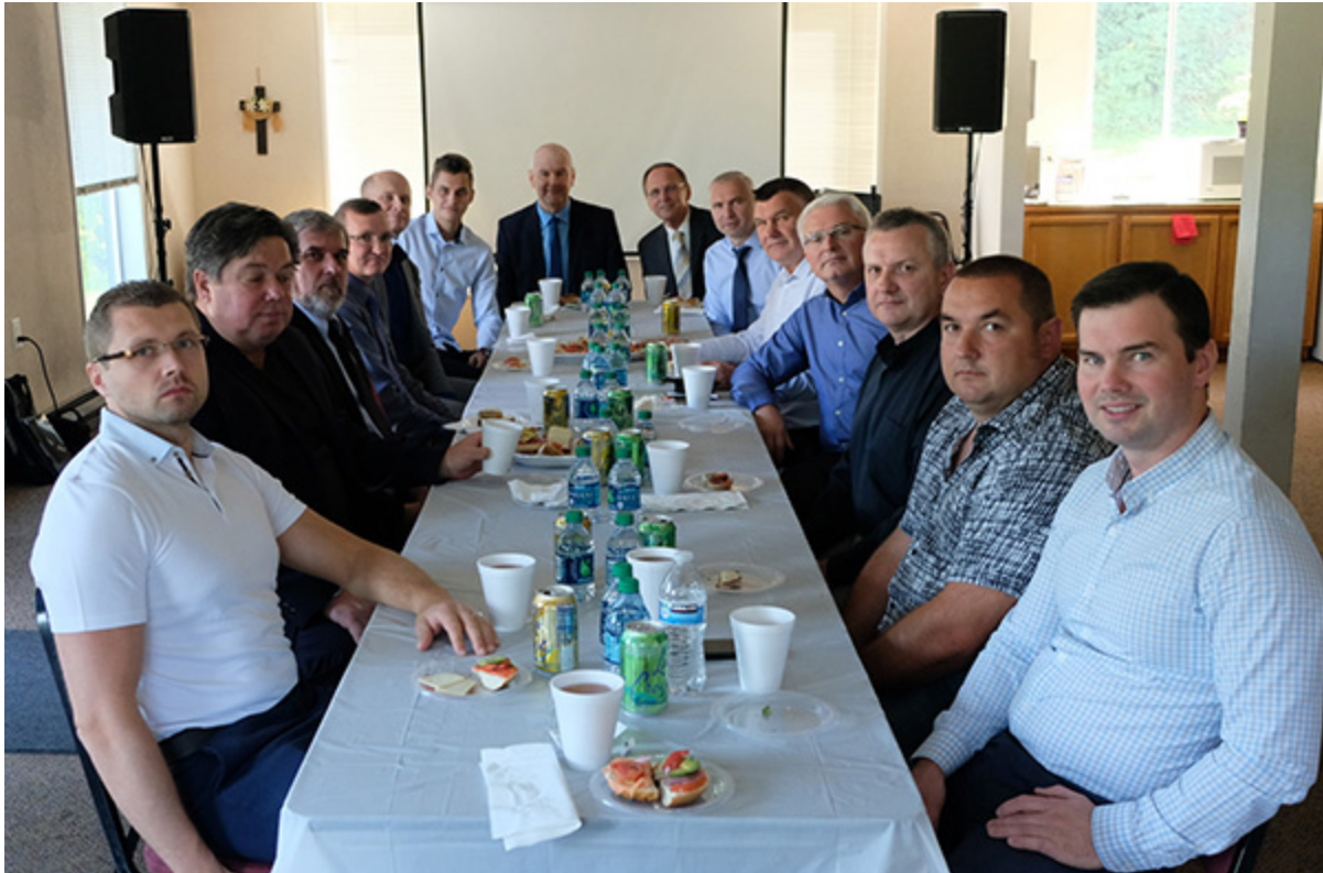
Fellowship of the Brethren