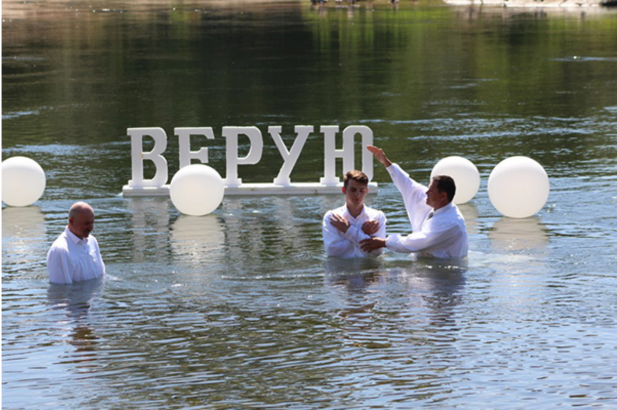
Baptism in the American River