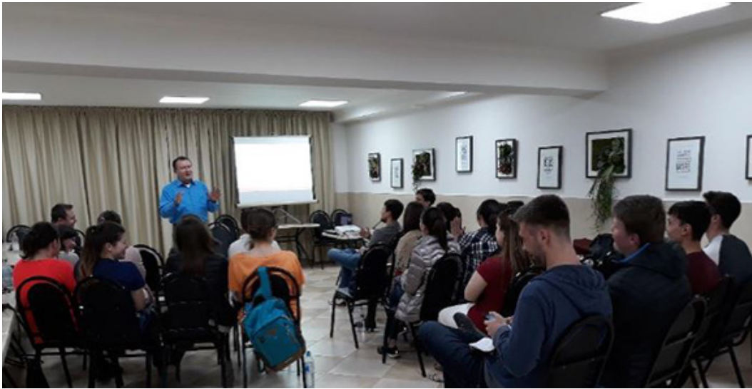
Meeting with the youth