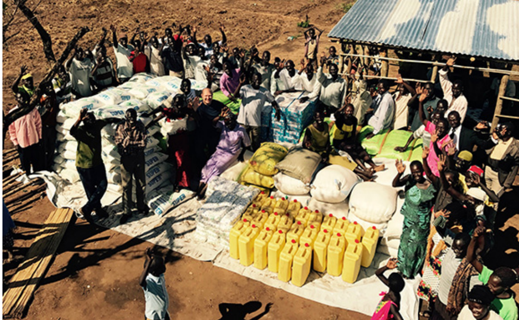
Help to refugees