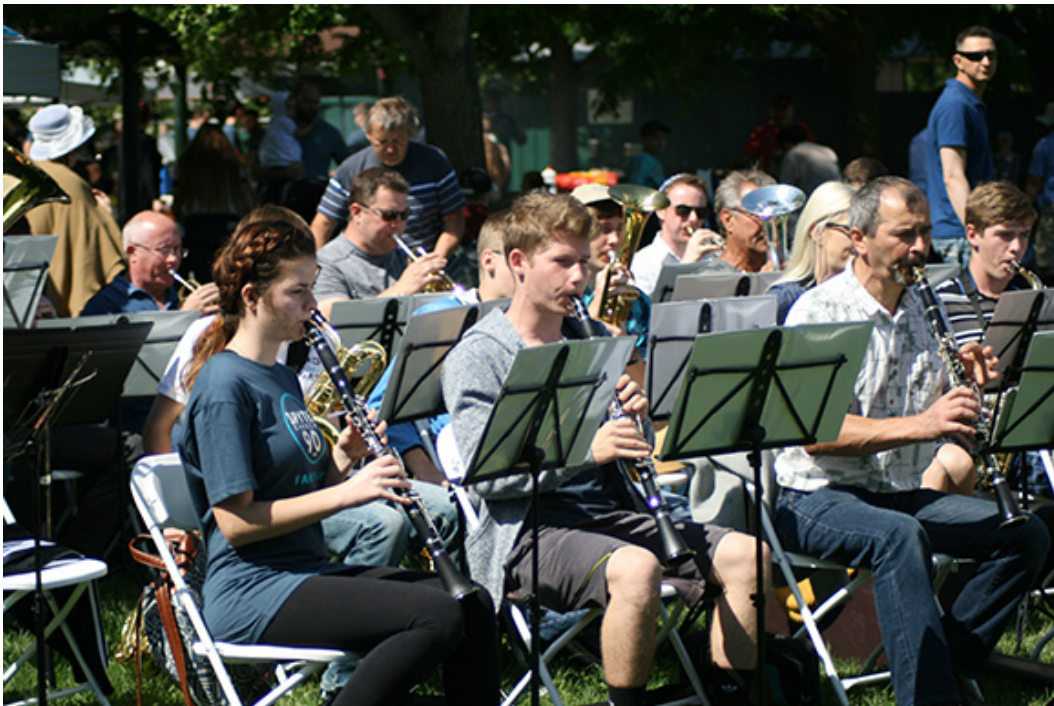
Wind orchestra of the church - wonderful addition to the celebration

For more about the celebration, please read on the Association's website - click here . The streaming of the park celebration can be accessed here , and the broadcast of the Sunday service - here . Both recordings are in Russian only.