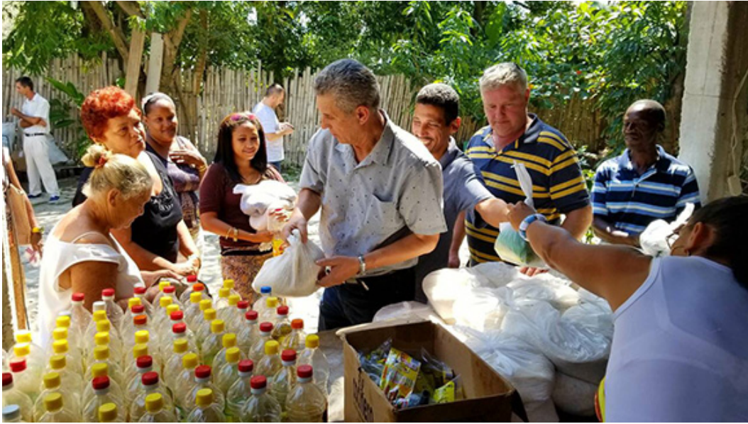
Distribution of relief supplies