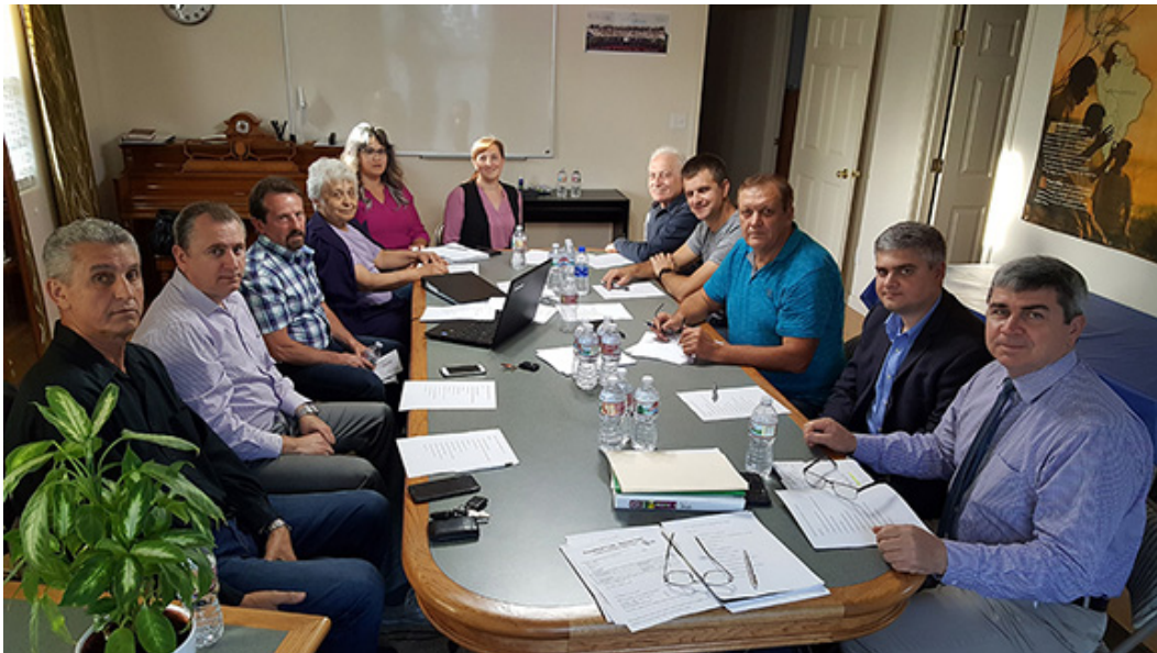
During the meeting.

At the end of the convention, there will be a celebratory service with the participation of the members of the local churches.