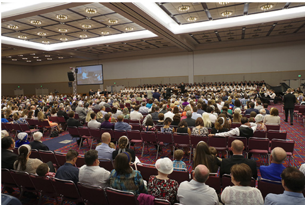
Closing service of the 18th Convention of North--Western Association of ECB Churches.