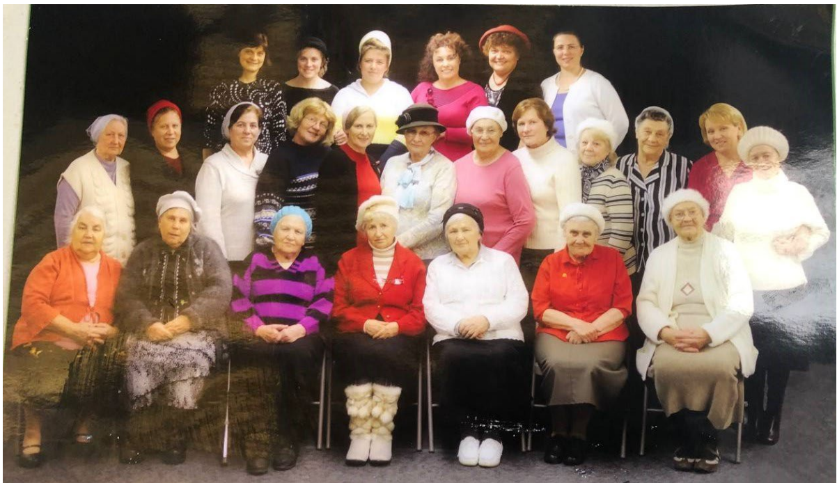
Prayer group of our church which exists for 30 years now